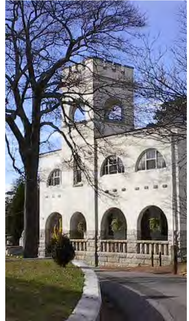
The Bell Tower in winter. As Oakland's workforce expands, the Bell Tower's limited space is no longer able to accommodate staff needs.

The following strategy on page 173 identifies staff needs to expand the restoration and enhancement of the cemetery. The strategy is outlined differently than others. There is no defined cost (employee costs can be variable), cemetery location, or partners. There is, however, a recommended sequence and timeline for staff hires. Additional staff positions will only be added as funding allows, and any staff additions will be considered part of an expanded operation budget and independent of proposed capital improvements.