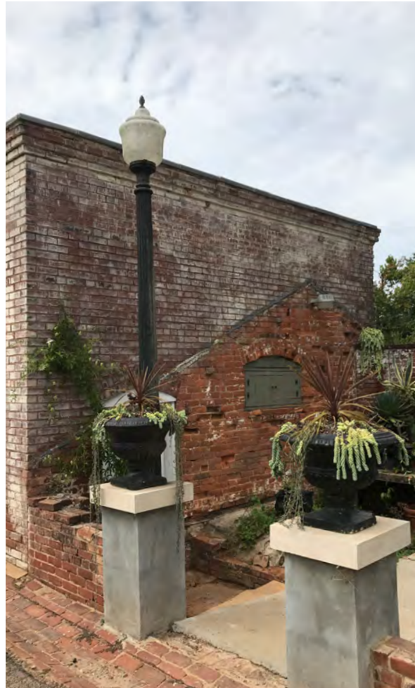
Recently installed historic pedestrian pole with a wall-mounted light on the Boiler Room in the background.