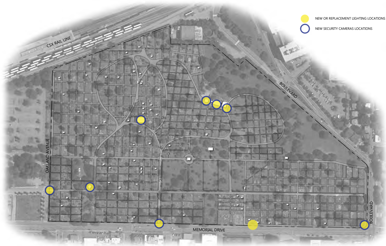
LIGHTING AND CAMERA LOCATIONS