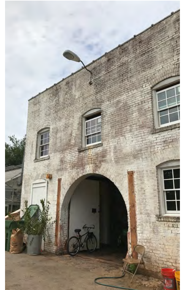
Existing wall-mounted cobra head lighting on the Carriage House.